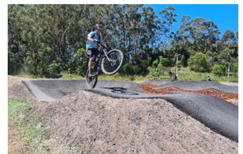
Trinity Ramsey testing the pump track