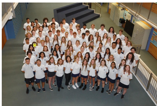
2022 Yr 12

Year 12 started their HSC exams last week and they continue up to the 7 th November. I wish our students all the best and know they will breathe a sigh of relief when they are finished.