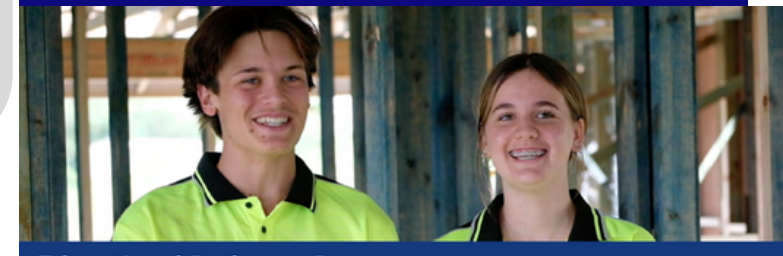
Educational Pathways Program

Apprenticeship and traineeship head start