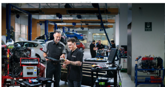
YES+ Automotive GRAFTON CAMPUS

Course description: YES+ is an initiative of the NSW Government and part of the NSW Department of Education's Educational Pathways Program.