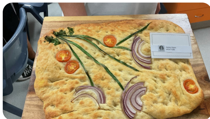
Year 11 Hospitality Class making Focaccia Bread Art